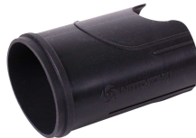
DRG1000 (Part No. TD10188)

We are pleased to inform you that the DRG1000 Rubber Grip which is the accessory for “delvo”, has been released. The details are as follows.